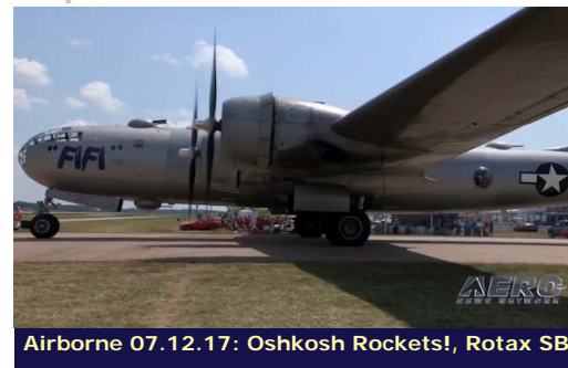
Airborne 07.12.17: Oshkosh Rockets!, Rotax SB,